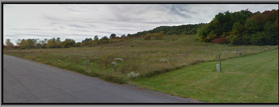
SITE VIEW FROM THE EAST