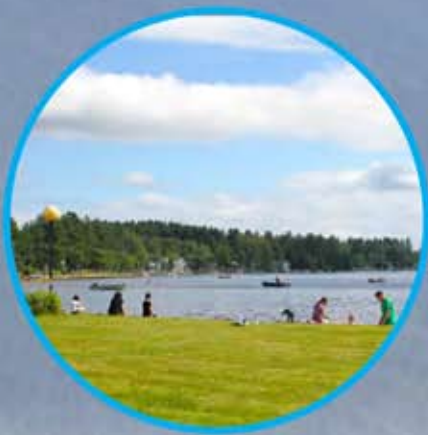
Beaches & Boating