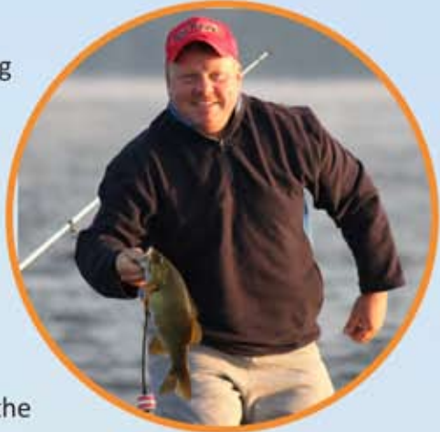
Fishing & Hunting