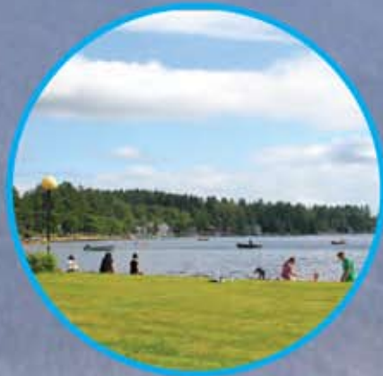
Beaches & Boating