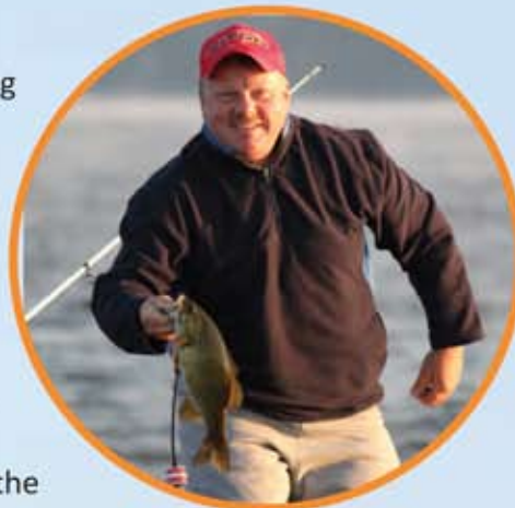
Fishing & Hunting